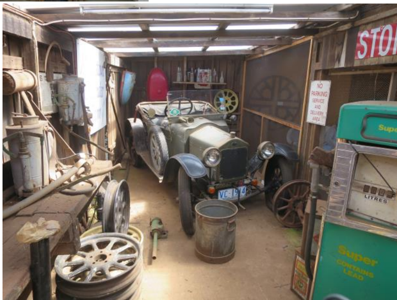
Stellite car belonging to the Lavender Farm