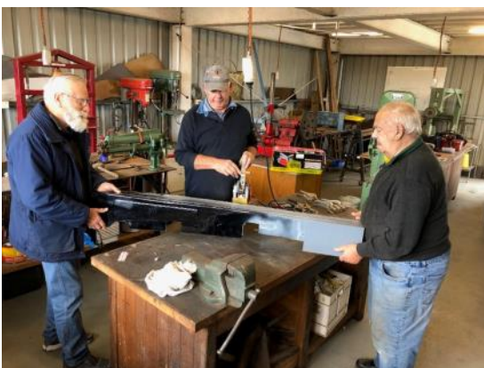
The restoration process