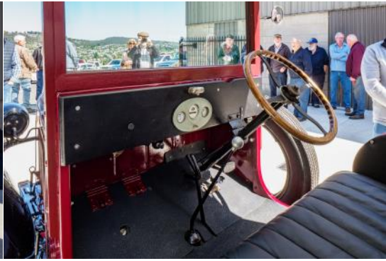
Showing it off to the public